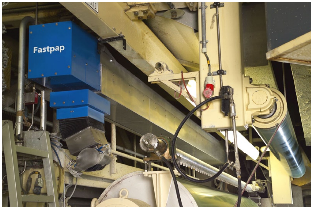
Fastpap LineSprint installed at a coating station for cleaning of the backing roll.